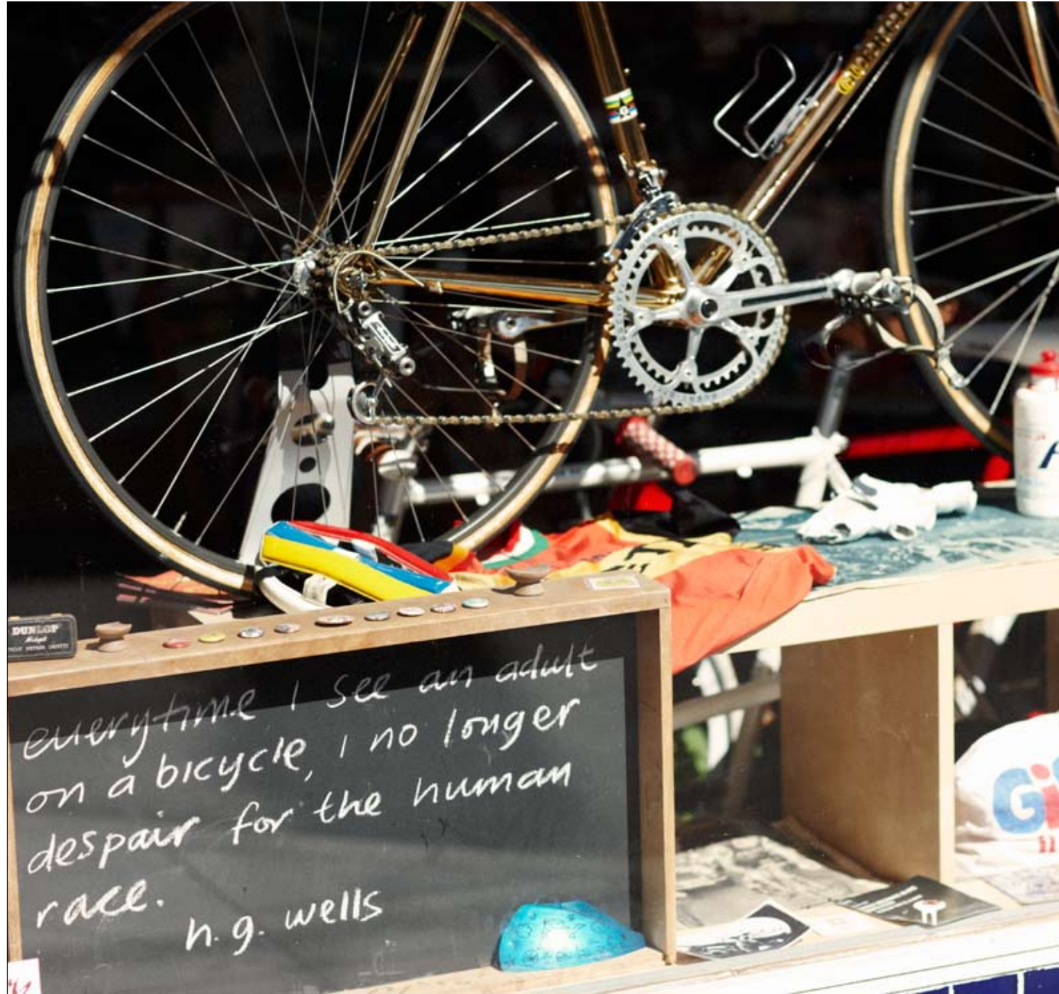
Northside Wheelers 2/155 Greville Street