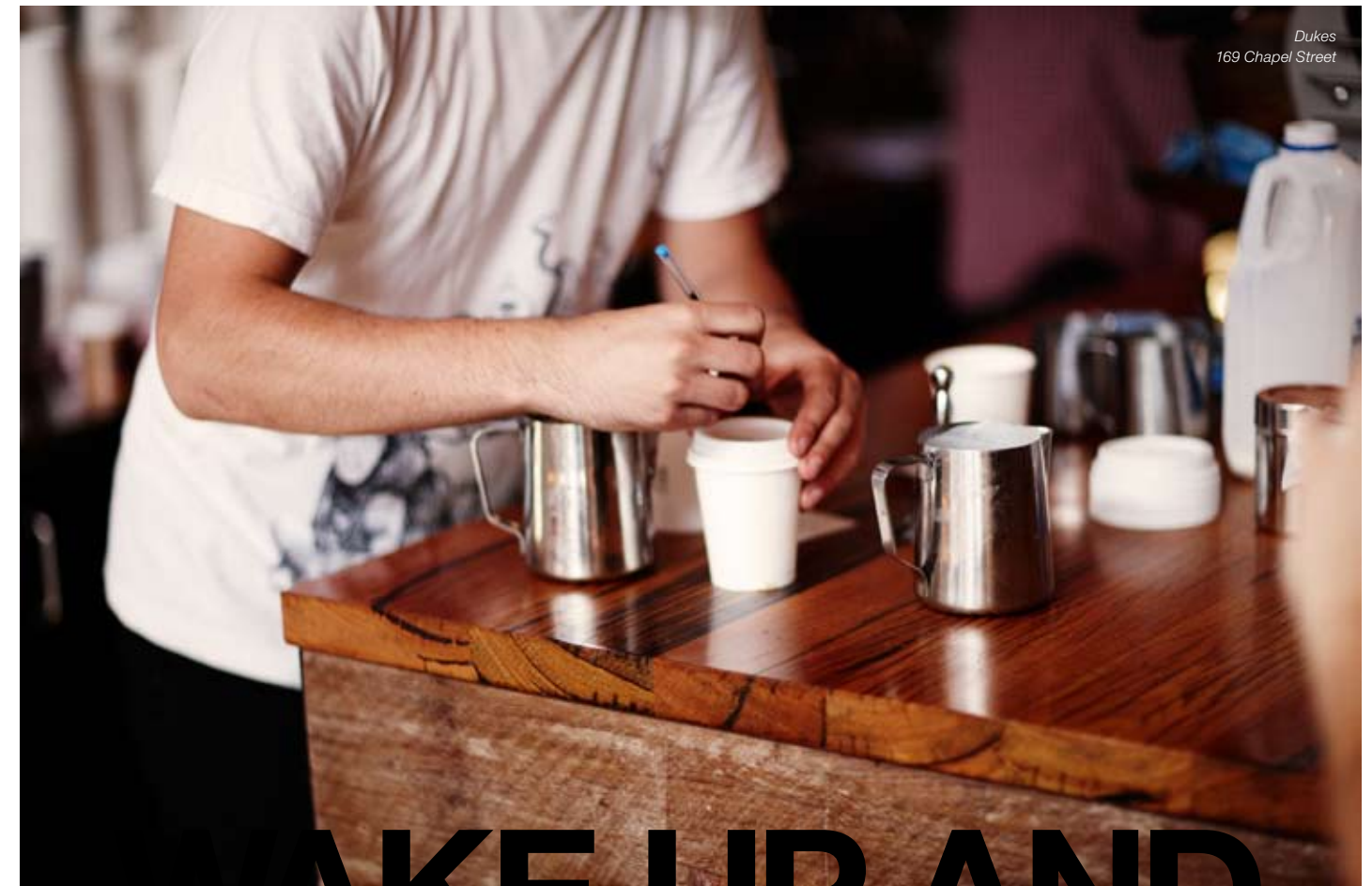
Dukes 169 Chapel Street