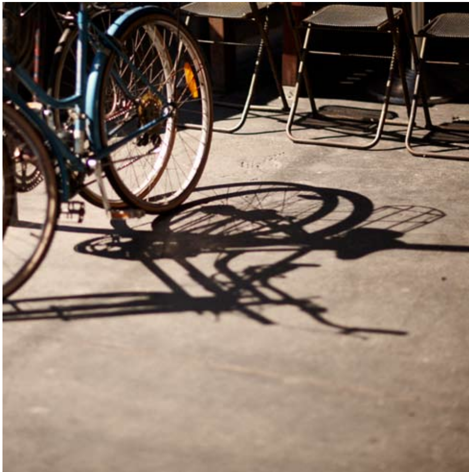
Bicycles along Chapel Street