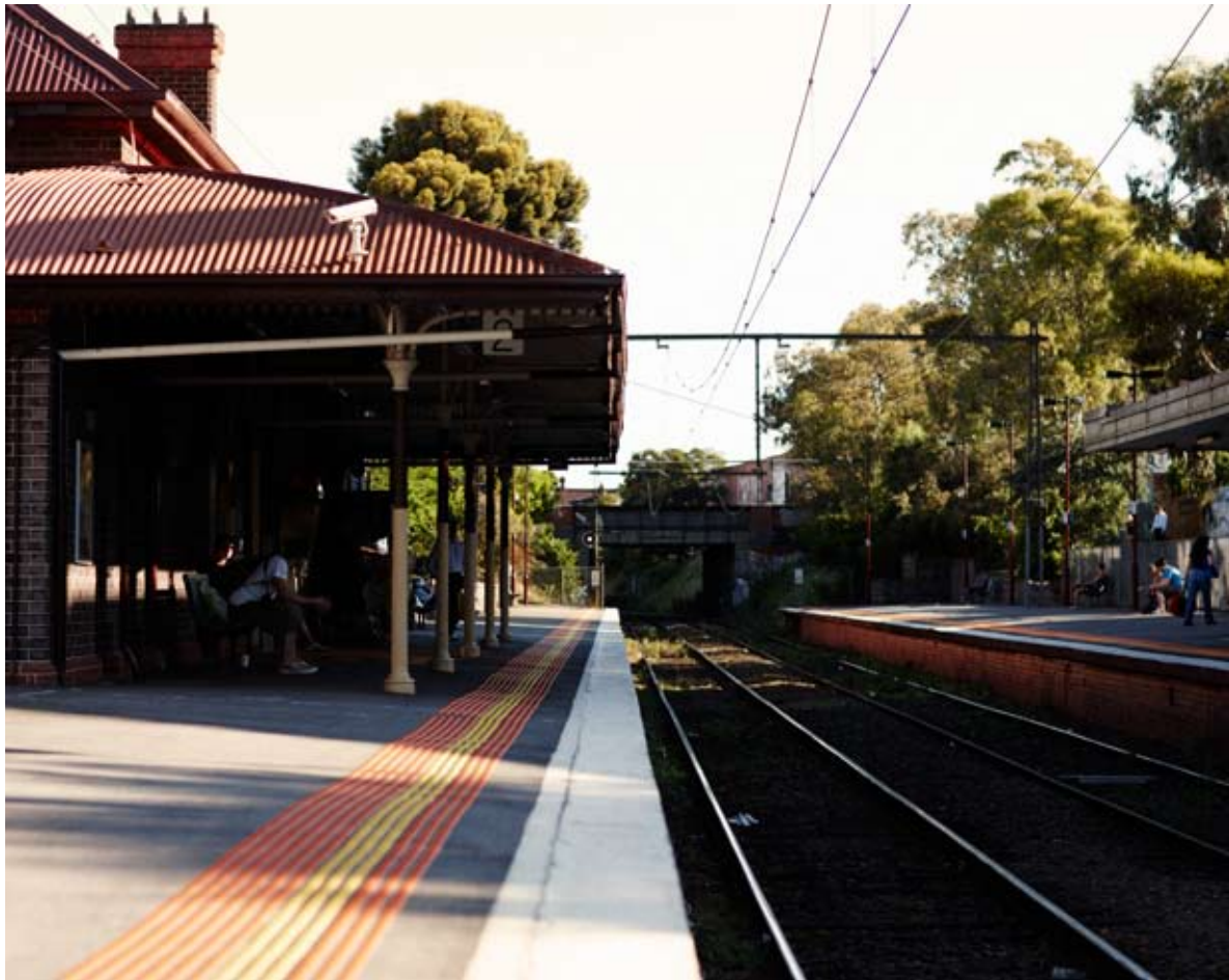
Prahran Train Station