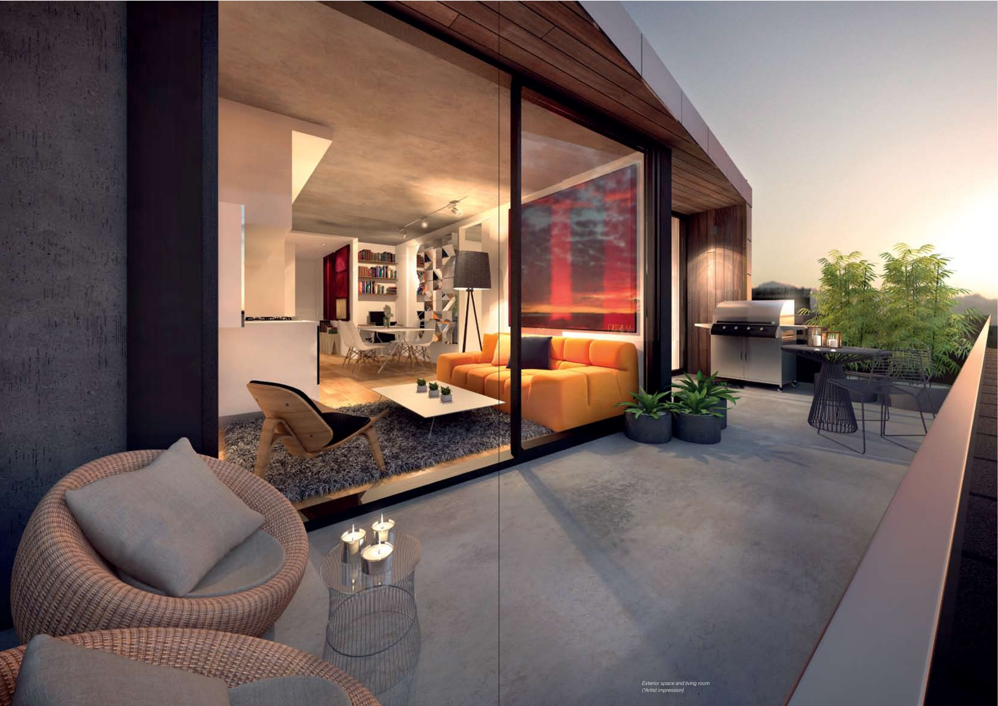
Exterior space and living room (*Artist impression)