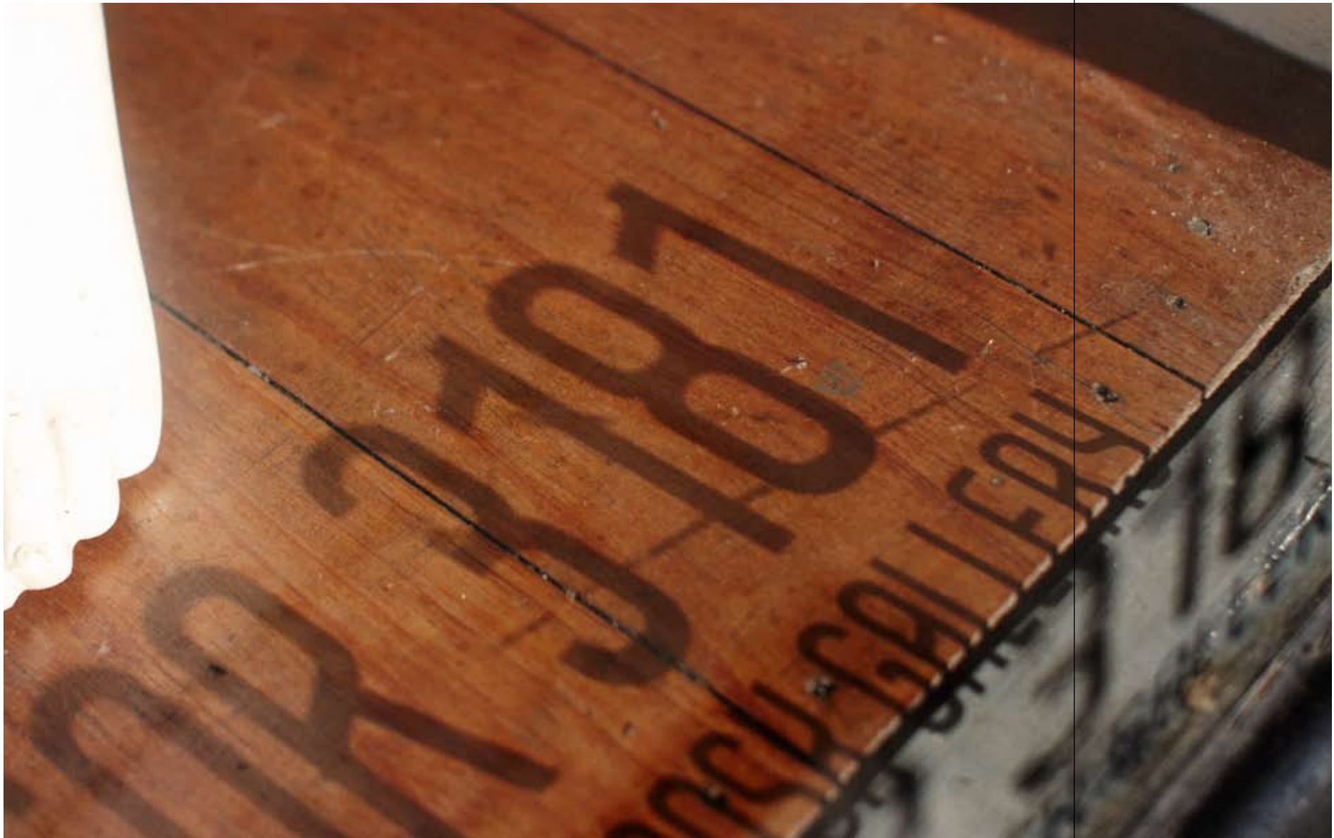
Dansk 113 Chapel Street