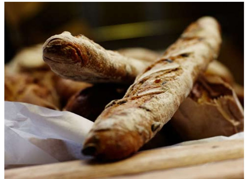
Artisan breads Prahran Market