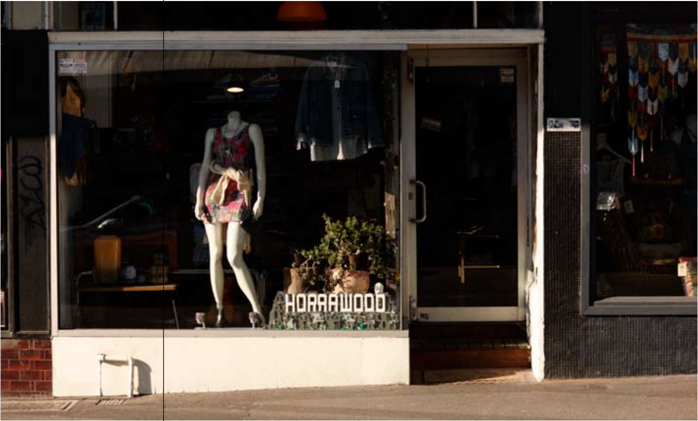
Horrawood 111 Greville Street

From fine fashion to vintage pieces, books and salons to record and home design stores, Prahran's Chapel, Greville and High Streets are some of the most sought-after shopping strips in Melbourne.