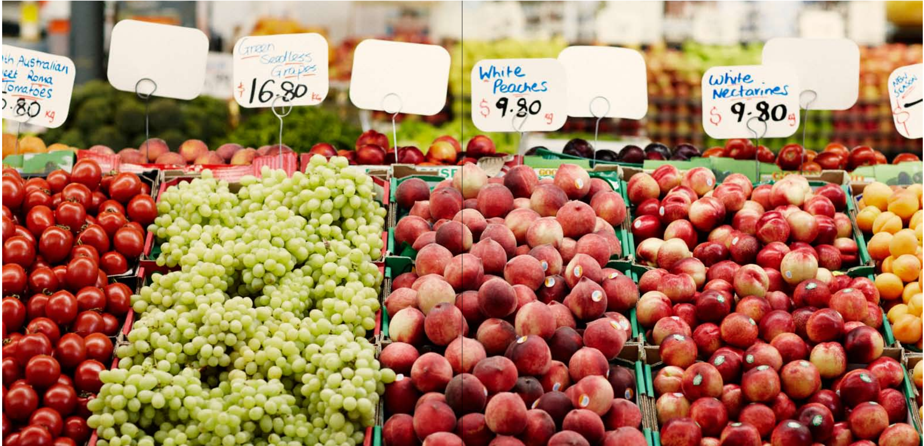
Surace Fresh Produce 233 Chapel Street