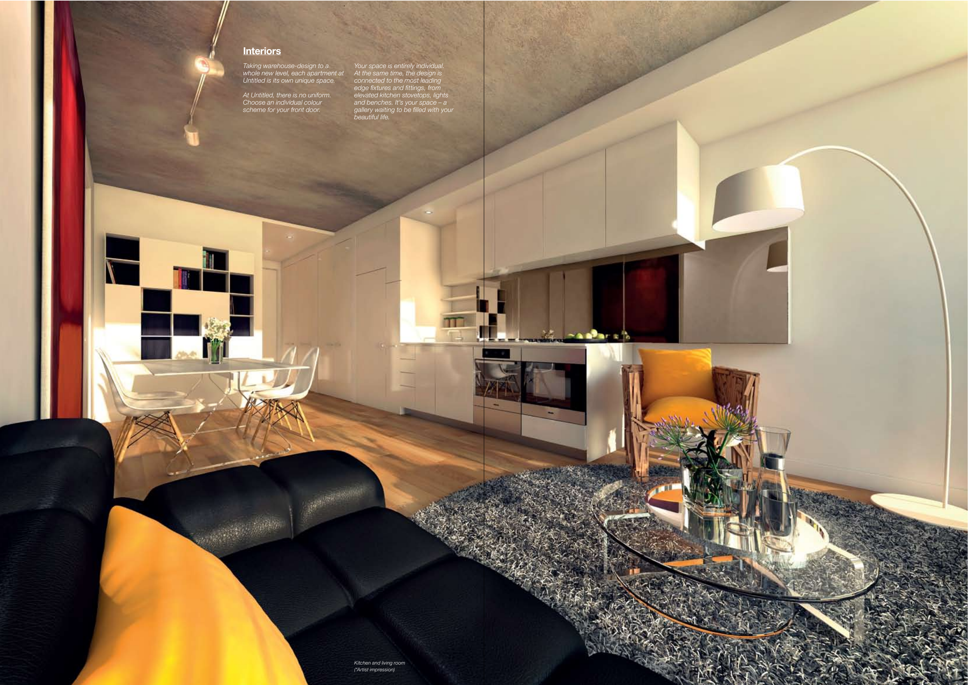
Kitchen and living room (*Artist impression)

Your space is entirely individual. At the same time, the design is connected to the most leading edge fixtures and fittings, from elevated kitchen stovetops, lights and benches. It's your space – a gallery waiting to be filled with your beautiful life.