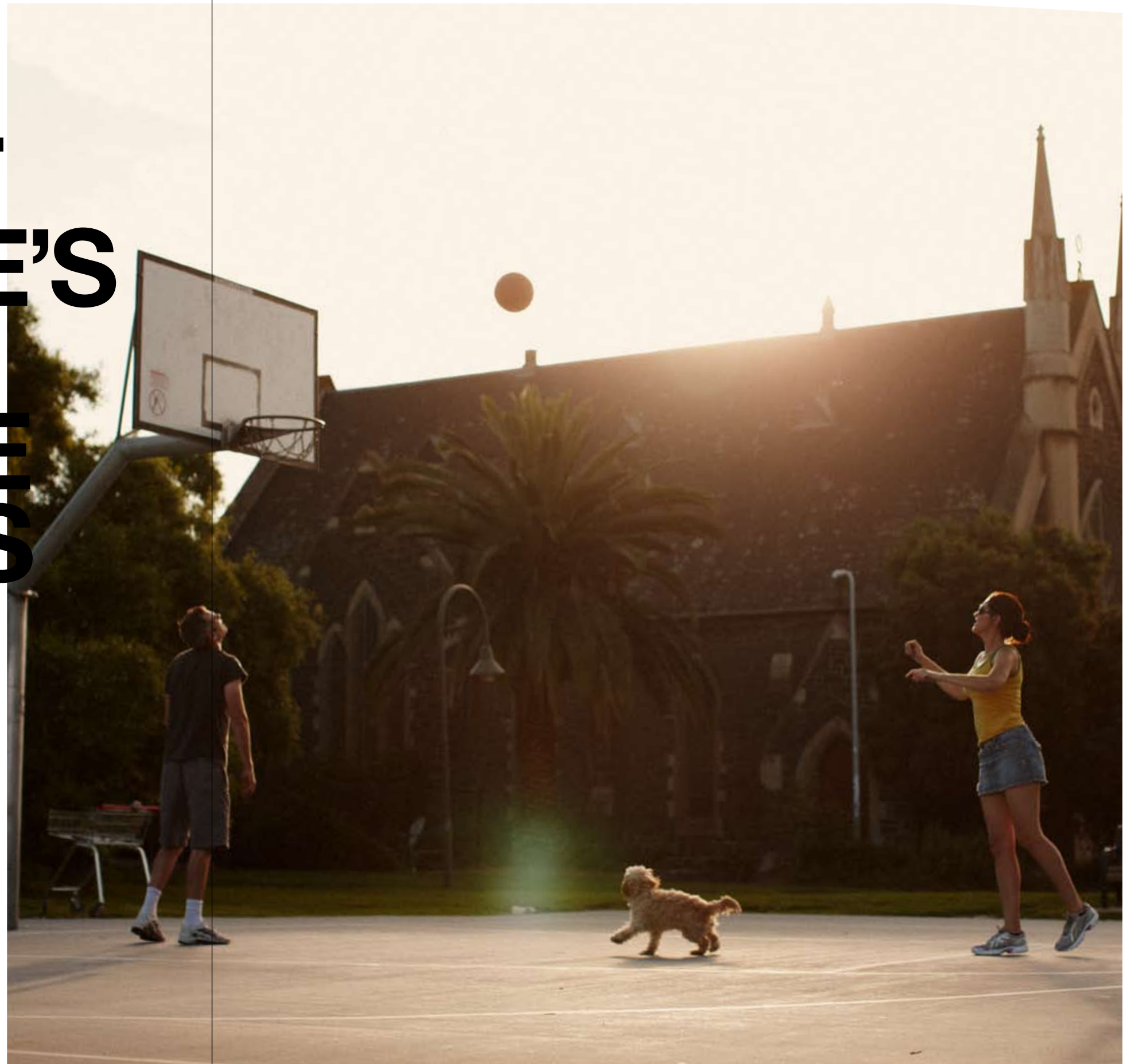
Princes Gardens basketball court and Chapel Off Chapel Theatre

Each apartment at Untitled is a blank page for you to create your life. Take a look at its uniquely themed spaces and envision a kaleidoscope of possibilities.