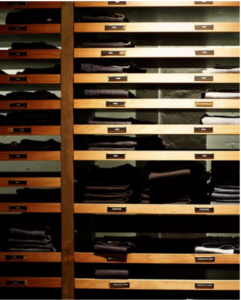
That Store 328 Chapel Street