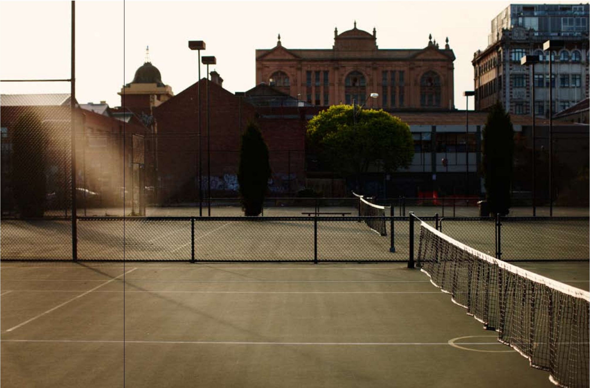
Tennis courts at Princes Gardens

Inner city living bursts out of every seam of Prahran. See some of Australia's finest up-and-coming actors tread the boards at Chapel Off Chapel and Red Stitch, or chill out with a choc-top and a classic at the iconic Astor Theatre on a Sunday.