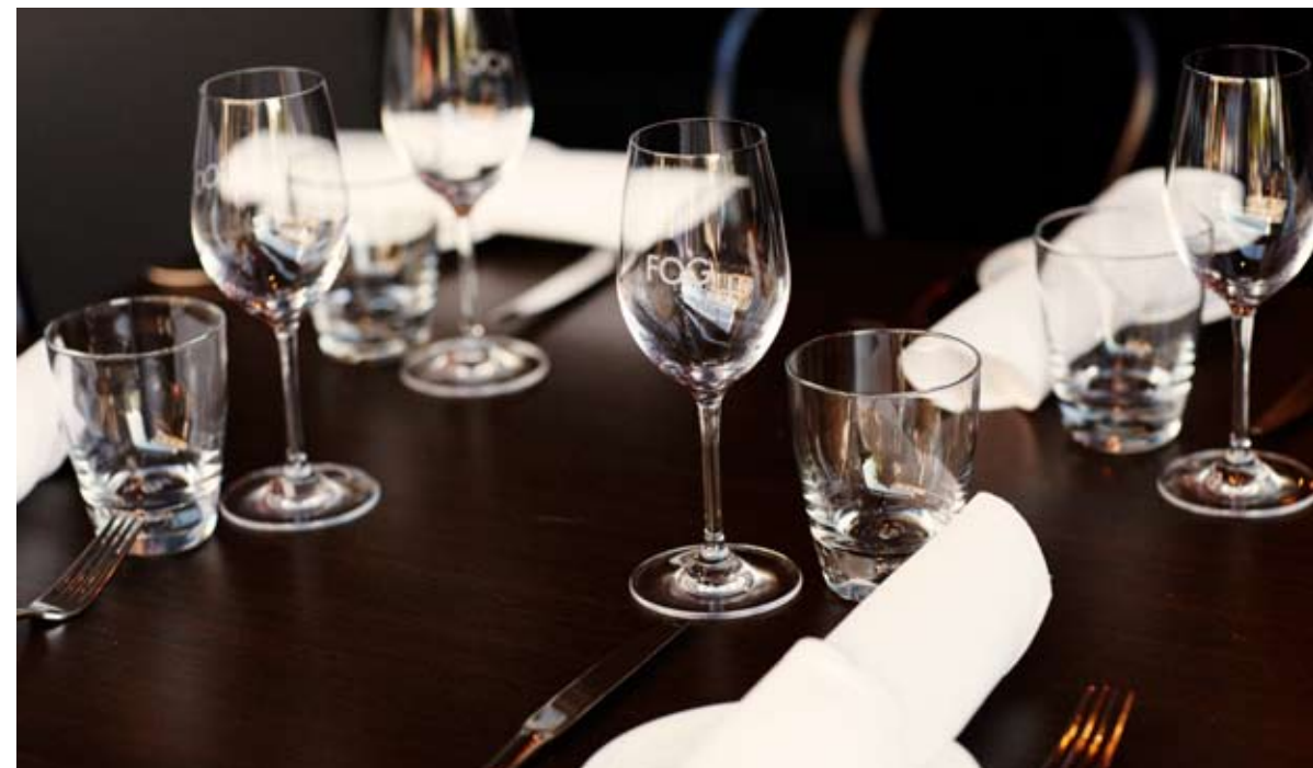
Fog Bar & Restaurant 142 Greville Street