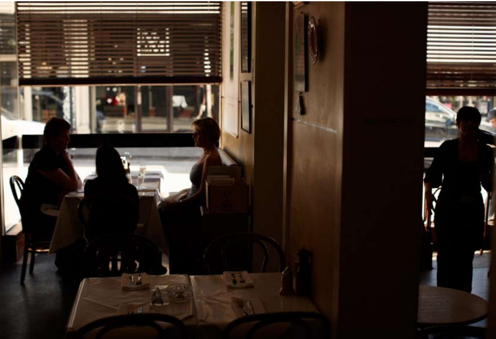
Sicilian Orange 115 Greville Street