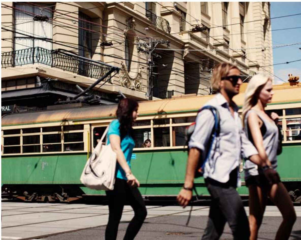
W-Class tram on Chapel Street