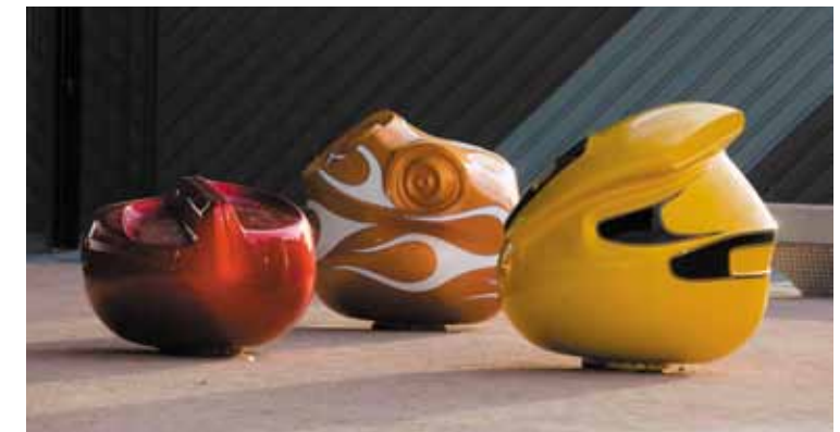
Above Top: Eagle, Bruce Armstrong (2003) Above: Car Nuggets, Patricia Piccinini (2006)

The art forms an inspiring backdrop to NewQuay's regular calendar of eye-opening events. From boat shows in summer to superb food celebrations, each is as diverse as the community.