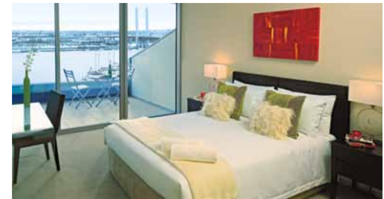
Above Top: Conder, NewQuay, Docklands Above: Conder, NewQuay, Docklands

Docklands Apartments Grand Mercure is located in NewQuay and offers contemporary designed, fully self contained 1, 2 and 3 bedroom apartments, with fully equipped kitchen and laundry, private balcony, spectacular views and access to a heated pool, gym and countless dining and shopping opportunities.