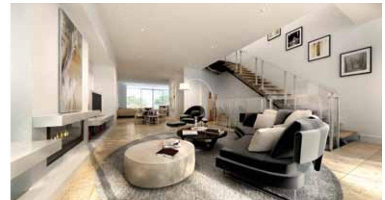
Above Top: Conder, NewQuay, Docklands