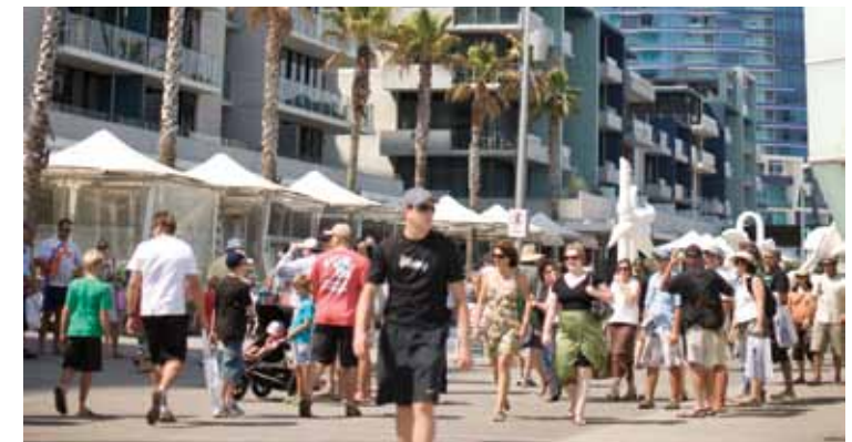
Above Top: Victoria Harbour Above: NewQuay Promenade, Docklands